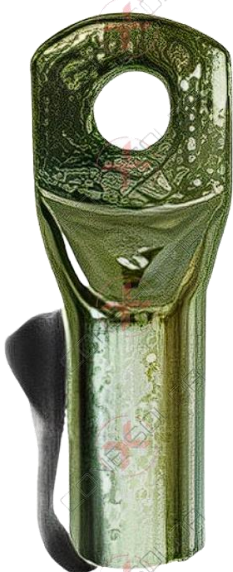
TM - L